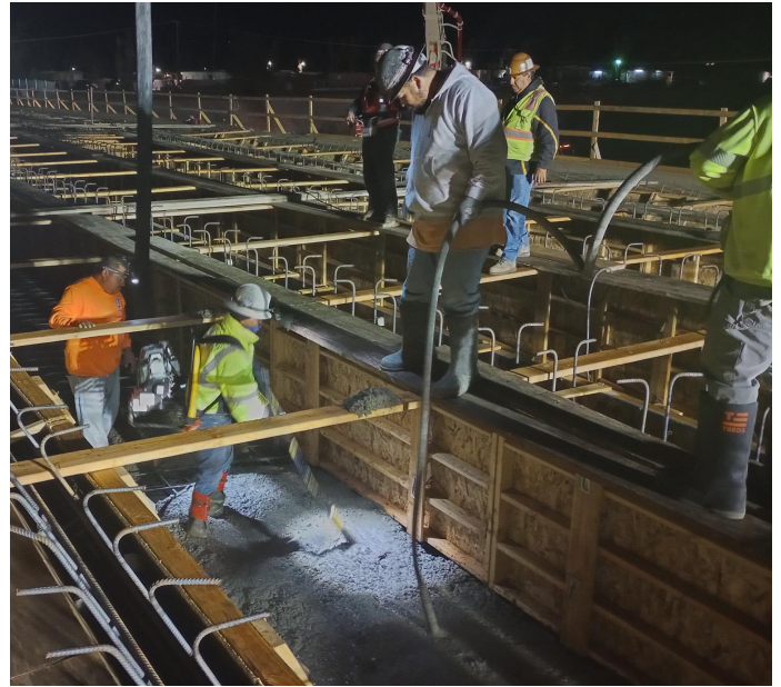
Crews placed 840 yards of concrete on the northbound/western bridge interior.