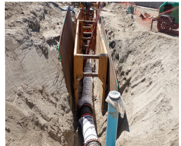
Column form removal after concrete placement curing period, 18" waterline installation at northern end of the project.