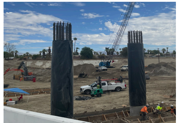
Crews working on bridge foundation construction

Crews continue to construct the eastern bridge span foundations. Column construction and abutment work is in progress with concrete placements scheduled weekly. Contractors will work on bridge structure falsework construction. Crews continue waterline installations.