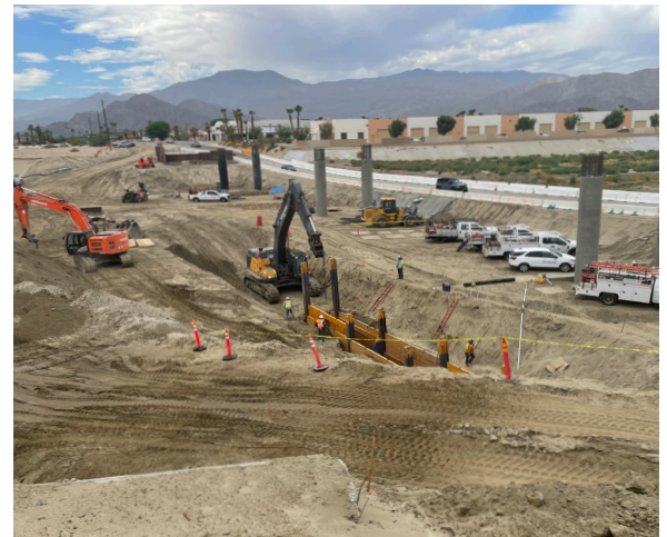
Contractors working on shoring for waterline installations