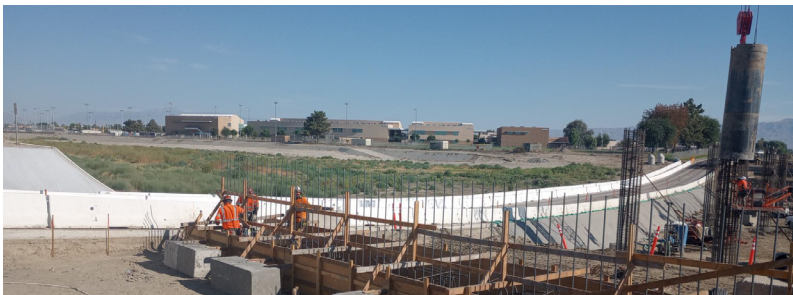
Crews working on rebar installation for the bridge support abutment, also foundation work.