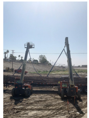
Crews receiving the next set of bridge support foundation cages. These rebar cages measure 5-feet by up to 110-feet-long and will be set into the ground near the current bypass roadway to eventually support the new northbound eastern bridge span.