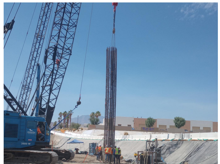
Crews drilling and preparing to set the next 60-inch-diameter rebar cage bridge support foundation into the ground.