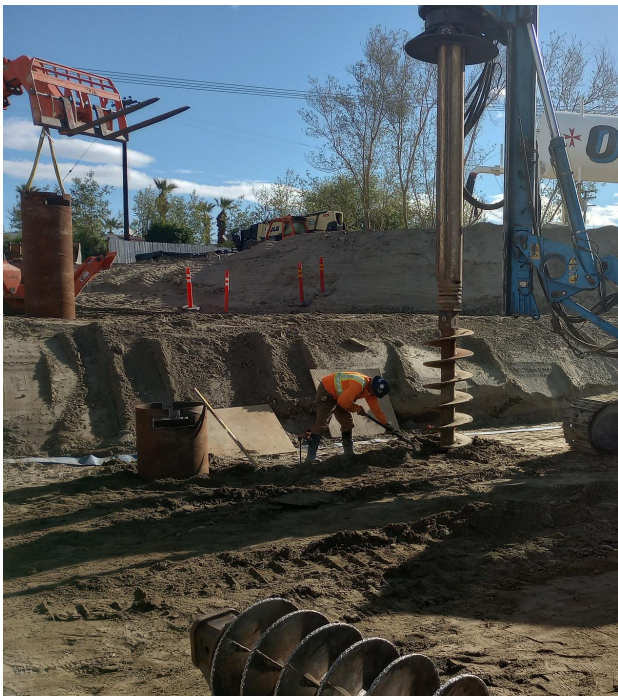
Contractors are drilling a hole for the concrete abutment footings.

Crews continue clearing and excavating the storm water channel. Contractors are performing footing work for the northbound eastern bridge span. Iron workers continue bridge support system construction with installations following the drill, set and concrete pour process as an ongoing operation.