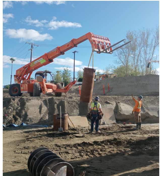
Contractors are placing the casing for the abutment.