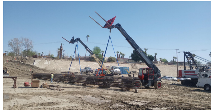
Heavy equipment mobilizing the column cages for the bridge support system.