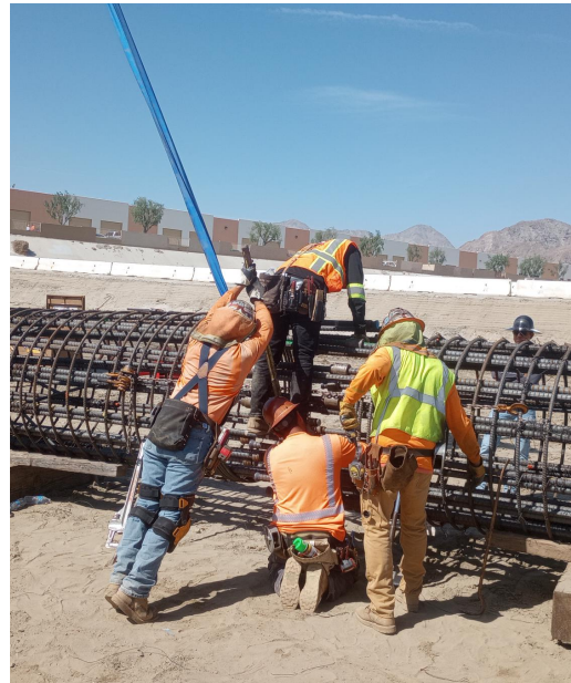
Crews working on column cage placement.