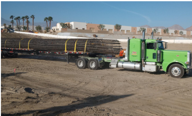
Trucks delivering the rebar column cages.