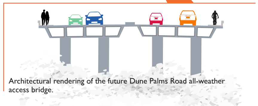
Architectural rendering of the future Dune Palms Road all-weather access bridge.